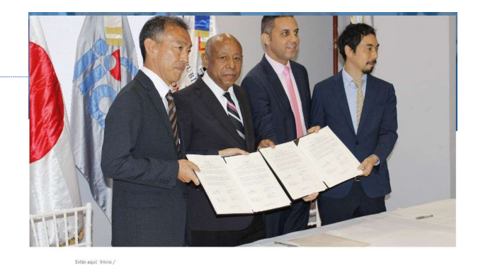
IAD, JICA, MIREX y MEPyD presentan logros proyecto de Peras Japonesas iniciado en Constanza